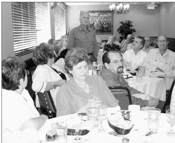
Partial view of those in attendance.

ices has lead to a cruel inflation that has immersed the Cuban people in a horrendous poverty."